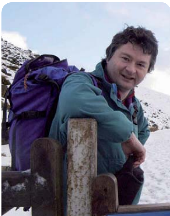
Alun Pugh AM

Minister for Culture, Welsh Language and Sport